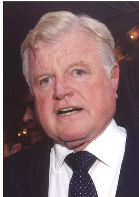
Late U.S. Sen. Ted Kennedy For "tax relief"??

But Bush was a Big Government politician. His signature jump-started