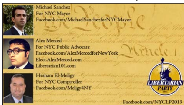
LP New York video promoting NYC candidates.

Petitioning in New York for independent bodies like the LP can be done only during a six-week period starting the week after Independence Day. This falls in